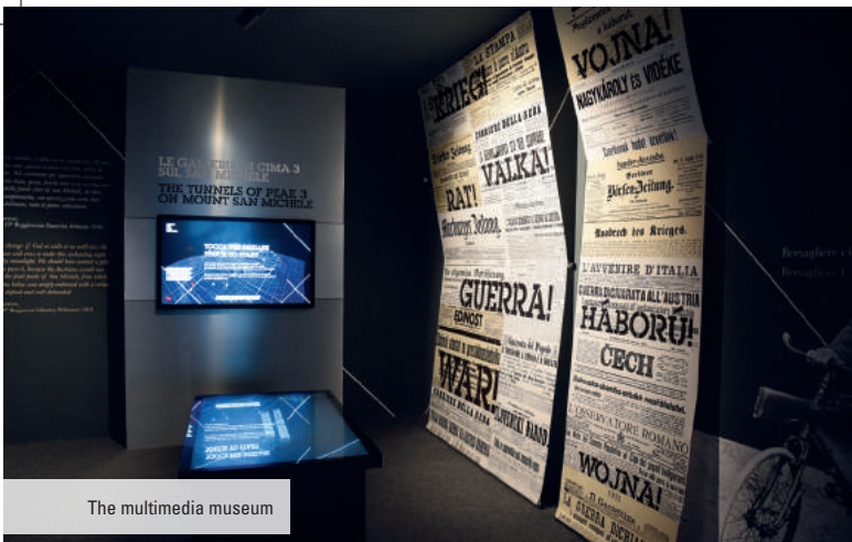
The multimedia museum