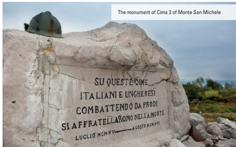
The monument of Cima 3 of Monte San Michele

For over a year, Italians and Austro-Hungarians fought fierce battles over it, resulting in tenths of thousands of casualties, so much that today, the mount has become a symbol for many European people's collective and historical memory. Nowadays numerous traces of the war remain on the Mount, and to these we have to add the ones of celebratory nature related to the monumental zone that was established here in 1922. It is to these areas that the literary works of Giuseppe Ungaretti, Prežihov Voranc, Gustav Heinse and Máté Zalka are tied. Museum visitors, walking along the site, will be able to observe monuments and memorial stones dedicated to various units that fought here alongside walkways, trenches, tunnels (such as the Schonburgtunnel and Lukachich's grotto, not open to visitors) as well as the Cima 3 gun emplacement, open to visitors with the same opening times as the multimedia museum. Moreover, in five designated locations of the open air museum, paying visitors will be able, thanks to a designated mobile app, access Augmented Reality contents.